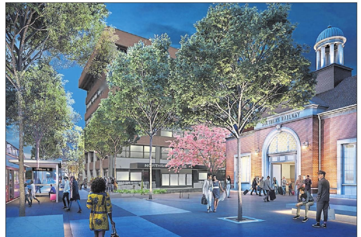
An artist impression of the new block of flats

A Bromley Council spokesman said: "It is important to note that this is not a planning application, with the Council being asked to consider whether a proposal requires an Environmental Impact Assessment (EIA). The Council will respond to this EIA Screening Opinion Request following a technical assessment of whether proposal requires an EIA under national criteria defined by Government. The Council's response will be publicly published in due course and potential planning applicants will then know whether they are required to submit an EIA along with any planning application for their development proposal."